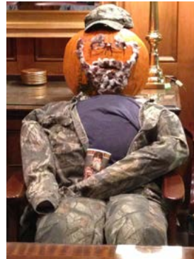
Uncle Si Pumpkin