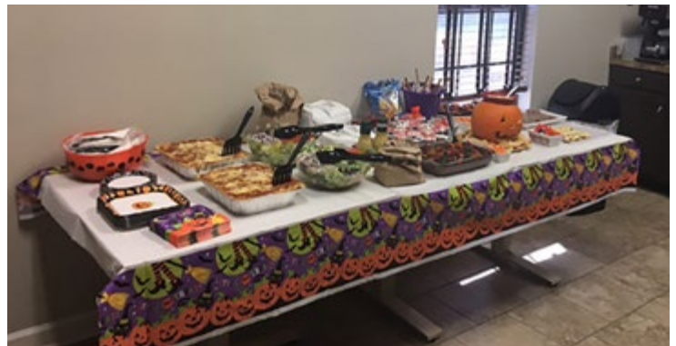
We had a great time celebrating Halloween at the office with games, trivia, and Halloween-themed treats!