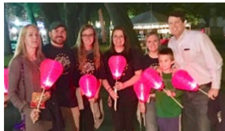
CSB at “Light the Night”

Our “Light the Night” team raised over $900 for the Leukemia and Lymphoma Society and came in 3rd place for top corporate fundraisers!