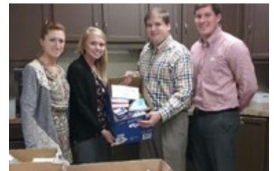
CSB preparing food baskets

For our Thanksgiving charity, we filled food baskets for families referred to the Child Advocacy Center (CAC). The CAC helps victims of child abuse and the non-offending parent with counseling and assistance through the legal process. We were able to donate enough food for 10 Thanksgiving dinners!