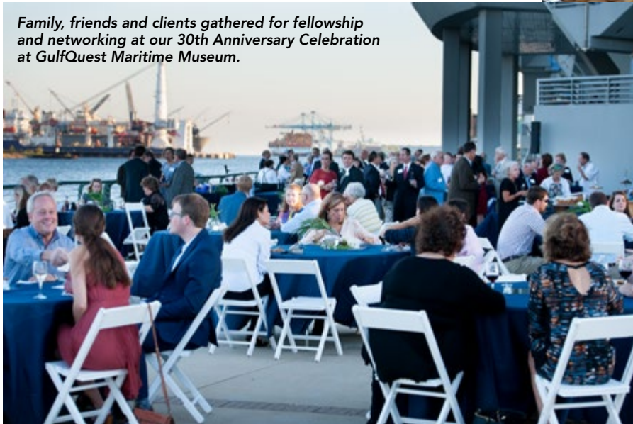
Family, friends and clients gathered for fellowship and networking at our 30th Anniversary Celebration at GulfQuest Maritime Museum.