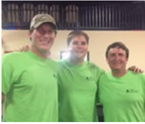
CSB team at Junior Achievement Bowling Classic