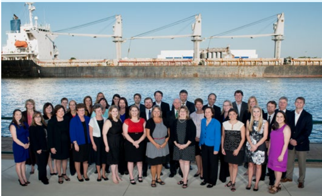
Our 30th Anniversary Celebration

This fall, Crow Shields Bailey P.C. celebrated three decades of serving our Gulf Coast community by hosting a 30th Anniversary Celebration at GulfQuest Maritime Museum with our valued family, friends and clients.